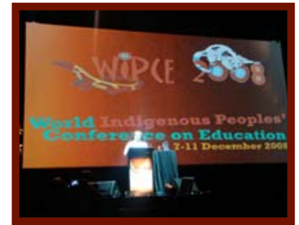
Above: Colleen during her keynote presentation

More information on WIPC:E 2008 can be found at www.wipce2008.com