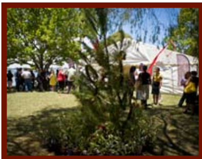
Above: Kulunga christmas tree