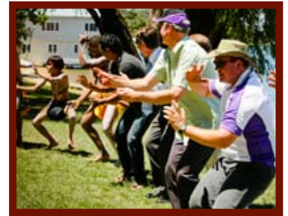
Above: Male guests participating in the dance activity

Kulunga would like to acknowledge the students of 'Kartajin Danjoo' - Challis Early Childhood Education Centre for the decorations especially hand made for our function.