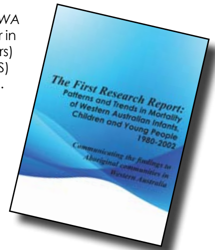
Above: The folder of fact sheets

A Second Research Report is planned for release in the second half of 2009. Currently, the review and classification of the deaths that have occurred between the years 2002 and 2006 are being finalised. The Second Research Report will extend the data reported in The First Research Report and build on the work that has been accomplished through The First Research Report .