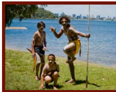
Above: Boys of the dance group