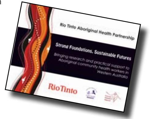
Above: Project Booklet

Based on research and community consultation in the Pilbara, Kimberley and Kwinana, this two year project will provide practical tools and activities to help close the gap in Aboriginal health outcomes.