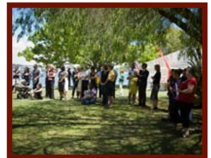
Above: Audience of the dance performance