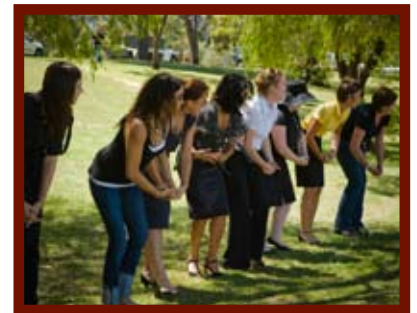
Above: Its the ladies turn at the dancing