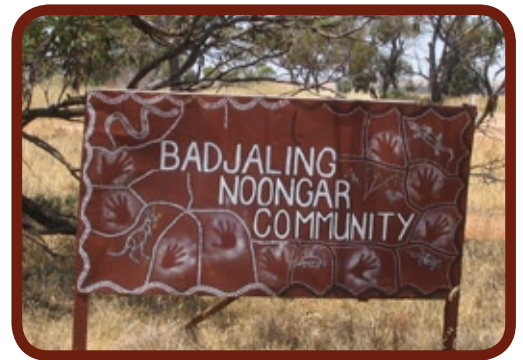
Right: Entrance to the Badjaling Noongar Community